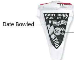
▶ Date Bowled ▶ Two lines of text (9 characters per line) ▶ Number of times score bowled