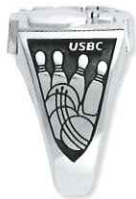
▶ No Personalization (Standard) No Charge